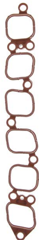
Porsche Cayenne Manifold Inlet: MG3900