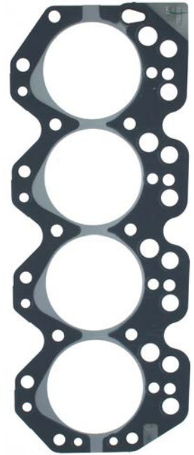
Toyota Landcruiser Head Gasket: S2310SS