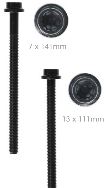
Volkswagen Head Bolt Set: HBS246

Don't forget to register for Cars in the Cloud!