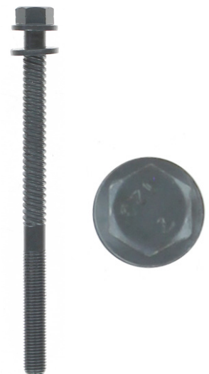
Volkswagen Caddy 2K Head Bolt Set: HBS365