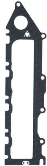
Seat Ateca 5F DFHA Manifold Inlet: MG4132