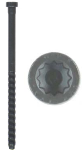
Audi A3/4/5/6, Q3/5 Head Bolt Set: HBS389 10 x 207mm