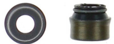
Volkswagen Caddy Gold DFHA Valve Stem Seal Set: VSS0385-16