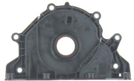
Volkswagen Caddy Gold DFHA Crankshaft Seal Front: OSS0504